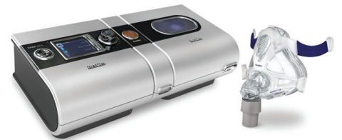
S9 VPAP ST-A with H5i humidifier and Quattro FX full face mask

Now you can provide intelligent air through iVAPS, ResMed's intelligent Volume-Assured Pressure Support. A unique technology featured in the S9 VPAP ST-A, it adjusts to a patient's respiratory rate, targets alveolar ventilation and automatically adjusts Pressure Support as needed to accommodate each patient's unique needs, even as their disease progresses.