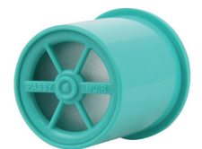
PMV® 007 (Aqua Color™)

It provides patients the opportunity to speak uninterrupted without having to wait for the ventilator to cycle and without being limited to a few words as experienced with "leak speech." By restoring communication and offering the additional clinical benefits of improved swallow, secretion control and oxygenation, the Passy-Muir Valve has improved the quality of life of ventilator-dependent patients for 25 years.