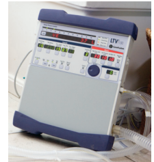
CareFusion LTV Series Ventilator

At 14.5 pounds and roughly the size of a laptop computer, the LTV Series ventilator features complex ventilation configured for convenience and mobility. CareFusion also offers the ReVel™ ventilator for portable ventilation on the fly. Weighing only 9.5 pounds and used for pediatric (> 5 kg) to adult patients in the home and hospital setting, this ventilator provides powerful technology to support you through the continuum of care.